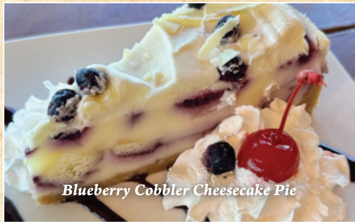
Blueberry Cobbler Cheesecake Pie