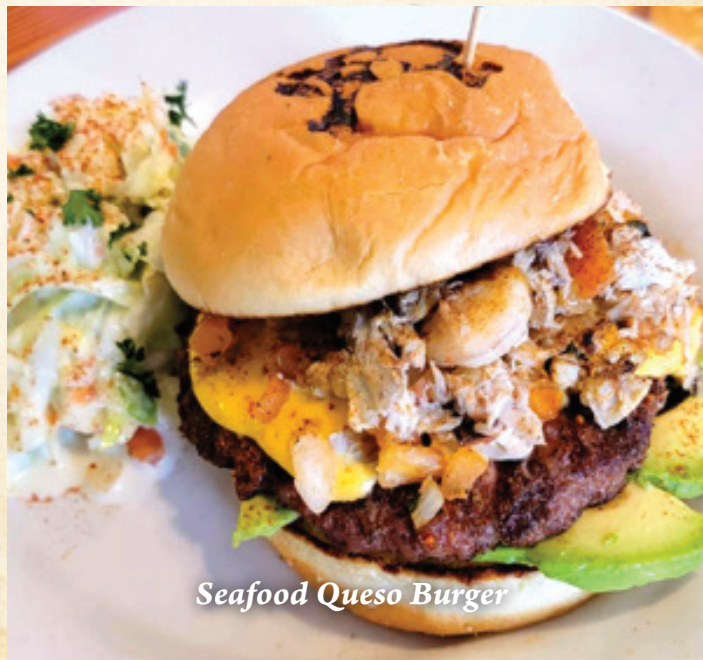
Seafood Queso Burger

PATTY MELT HAMBURGER with grilled onions & cheddar served on rye ..... 9.99