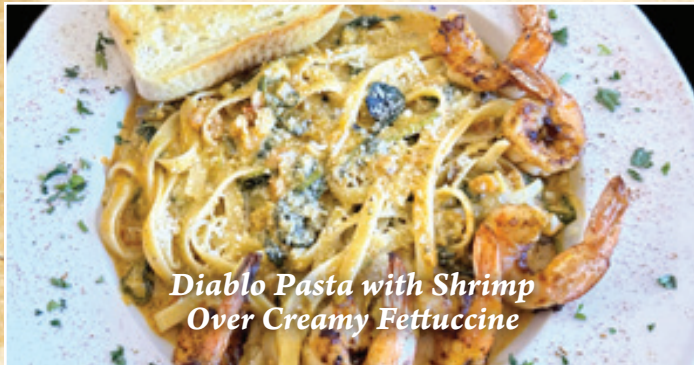
Diablo Pasta with Shrimp Over Creamy Fettuccine

FEATURED FISH & FETTUCCINE WITH ALFREDO OR DIABLO SAUCE ..... 19.99