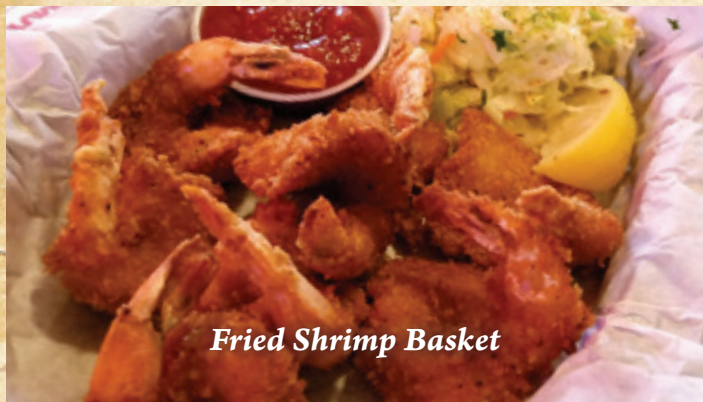
Fried Shrimp Basket