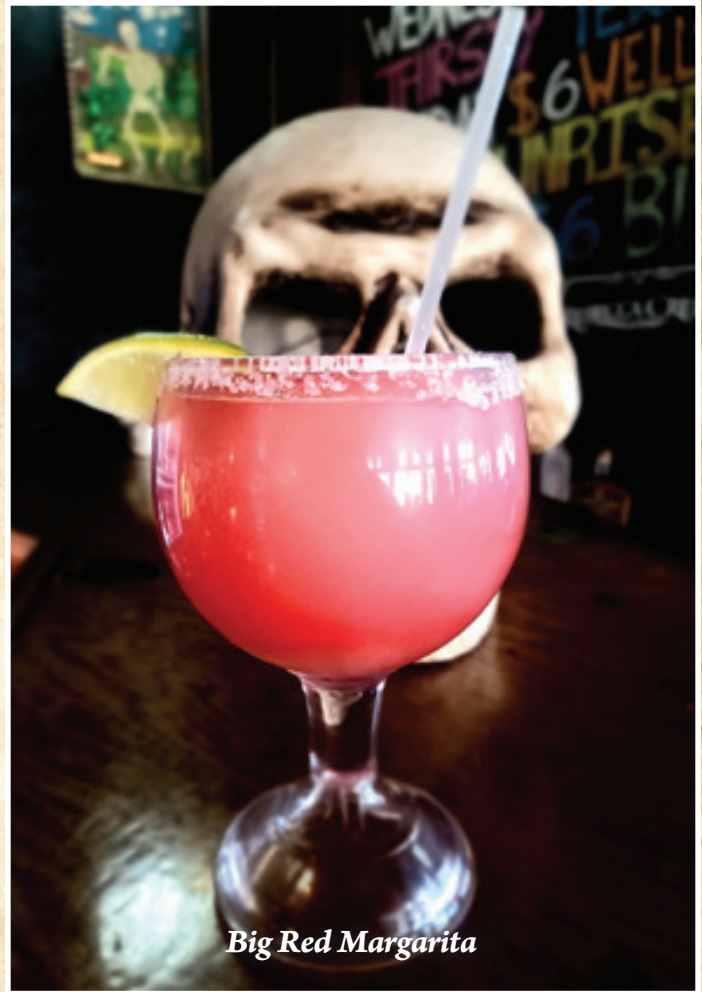
Big Red Margarita

Stella Artois..... 4.99 Miller Light..... 3.99 Heineken..... 4.99 Michelob Ultra..... 3.99 Karbach Hopadillo..... 4.99 Woodchuck Cider..... 4.99 Corona..... 4.99 Lone Star..... 3.99 Dos Equis Lager..... 4.99 Shiner Bock..... 4.99 Modelo Especial..... 4.99 Michelob Ultra Lime Negra Modelo..... 4.99 Cactus..... 4.99 Pacifico..... 4.99 Ziegenbock..... 4.99 Blue Moon..... 4.99 Shiner Blonde..... 4.99 Budweiser..... 3.99 Twisted Tea..... 4.99 Bud Light..... 3.99 Ultra Gold..... 4.99 Corona Premier..... 4.99 Topo Chico Hard Seltzer 4.99 Coors Light..... 3.99 Voodoo Ranger..... 4.99 Landshark..... 4.99 Heineken 0.0..... 3.99