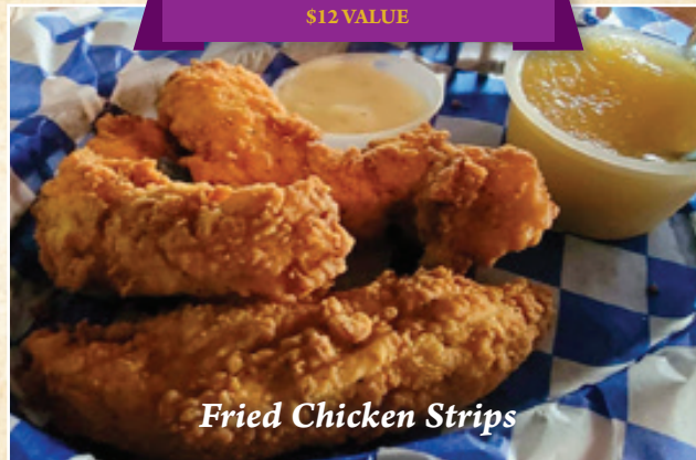
Fried Chicken Strips