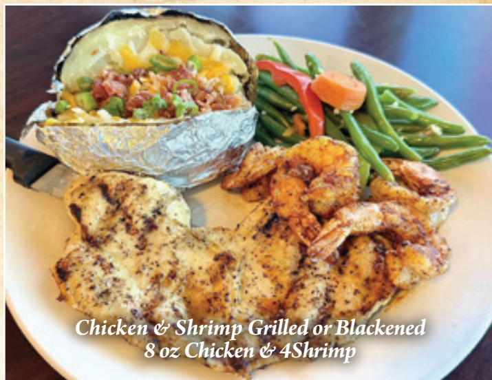
Chicken & Shrimp Grilled or Blackened 8 oz Chicken & 4 Shrimp

Consuming raw or under-cooked meats, poultry, seafood or shellfish may increase your risk of foodborne illness, especially if you have a medical condition. If you have a food allergy, please tell your server.