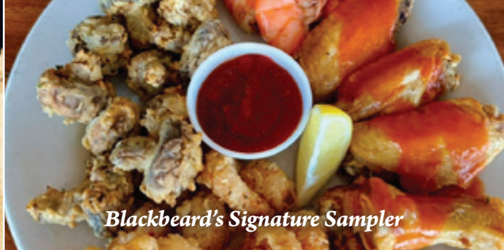
Blackbeard's Signature Sampler